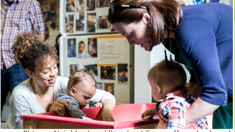
Phinney Neighborhood Preschool Co-op offers play-based learning for infants-age 5.