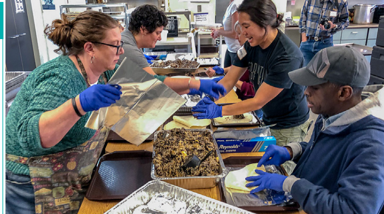
Burritos Without Borders volunteers makes 350 burritos at a time for people experiencing homelessness.

Whittier Kids School Age and Preschool Programs