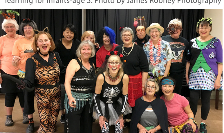
Greenwood Senior Center's Zumba class enjoy Halloween fun.

635 people, organizations, and groups rented space