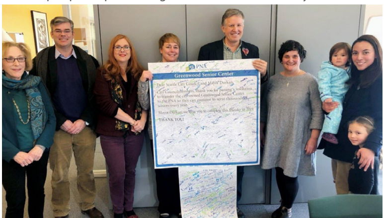
Staff and board advocate for the Greenwood Senior Center with a petition at City Hall